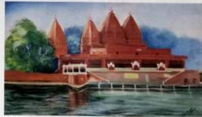
Landscape 25"x18" Acrylic