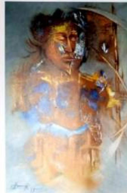
Be Human 31" x 48" Acrylic