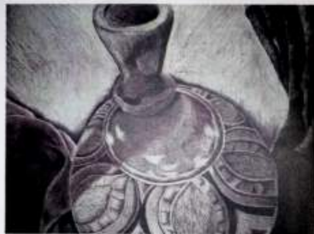
Still Life 30"x24" Oil colour