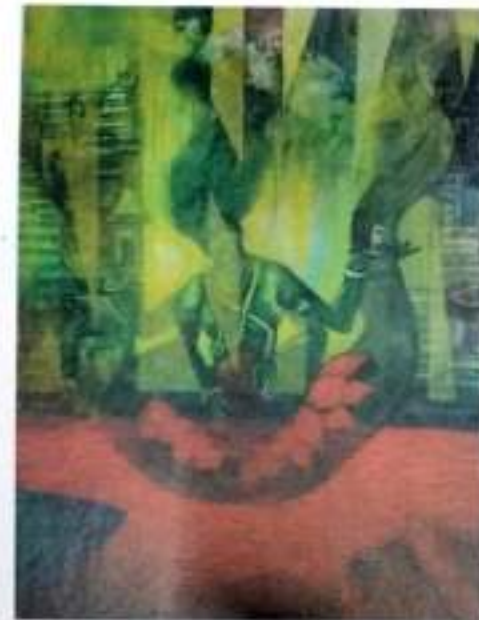
Ganga 30" x 40" Acrylic