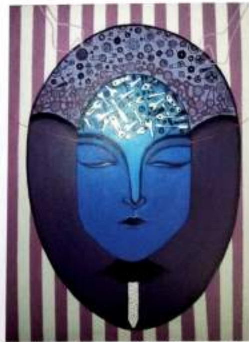
Life is like a machine