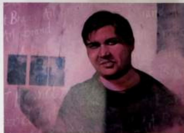
Portrait 30"x40" Acrylic