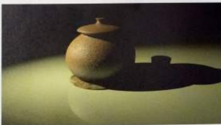
3D Object (Pot) Autodesk Maya (Mental Ray Render Engine)