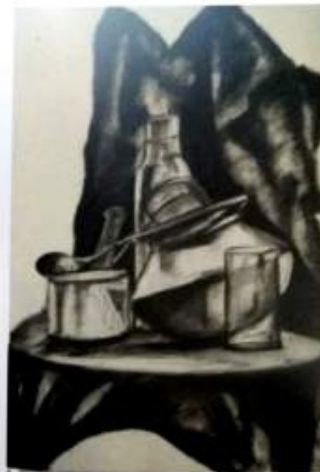
Still Life 18"x23" Dry Pastel