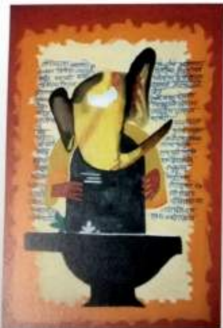
Garpat 20"x23" Mix Media