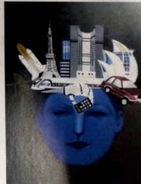
Htech Mind 40"x30" Acrylic