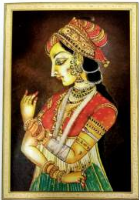
Conservation needed at every age! Keep Domestic Violence