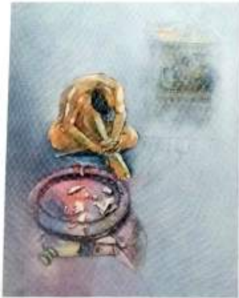
Women Harassment 14"x18" Acrylic