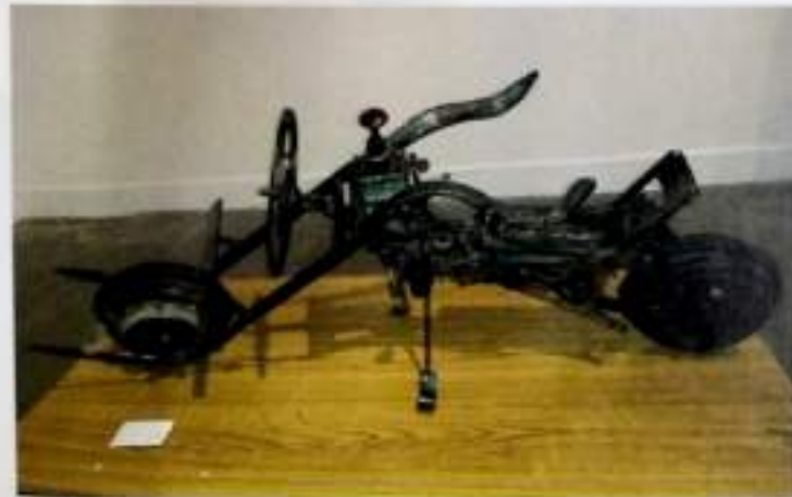
Social Evil 48" x 18" Waste Material