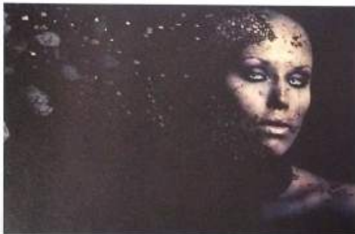
Digital Art (Shutter) Adobe Photoshop