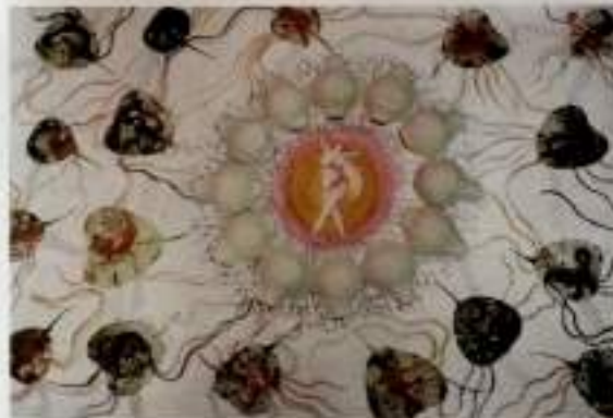
Pregnancy Calander 36"x30" Mix media