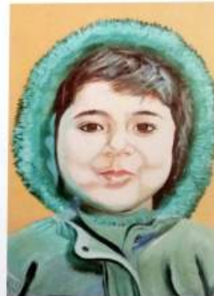
Portrait 30"x40" Acrylic