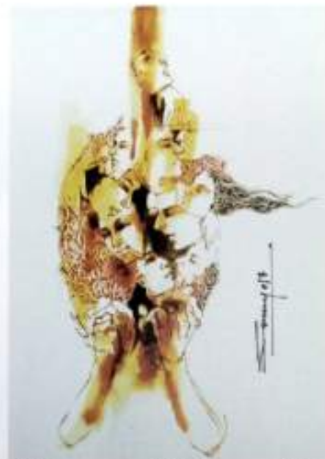
Untitled 18" x 24" Acrylic