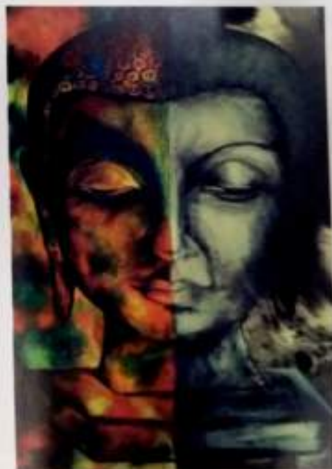
Expression of face