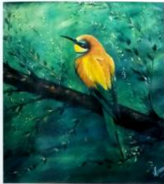
Freedom 24" x 24" Oil colour