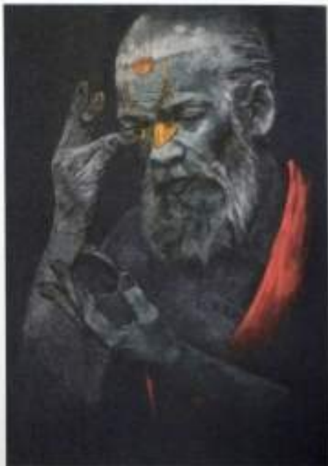
Shringar 60"x45" Acrylic