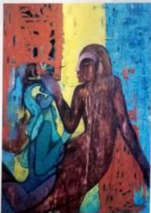
Dreamland 24" x 30" Mix media