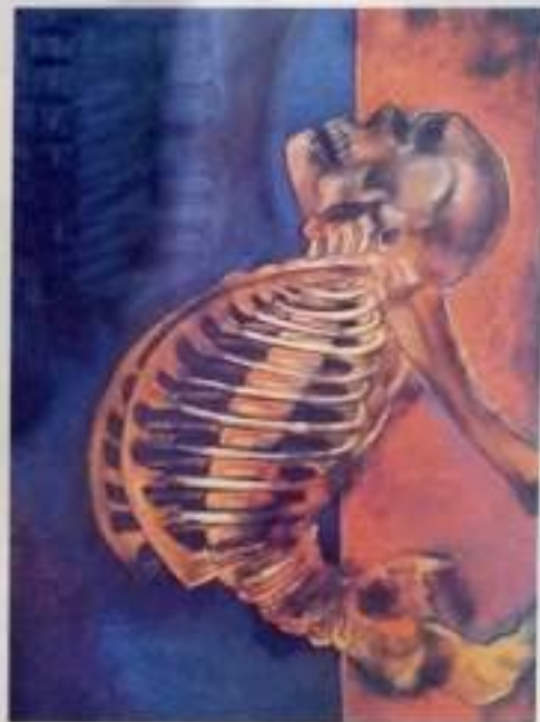
Pain 28"x36" Acrylic