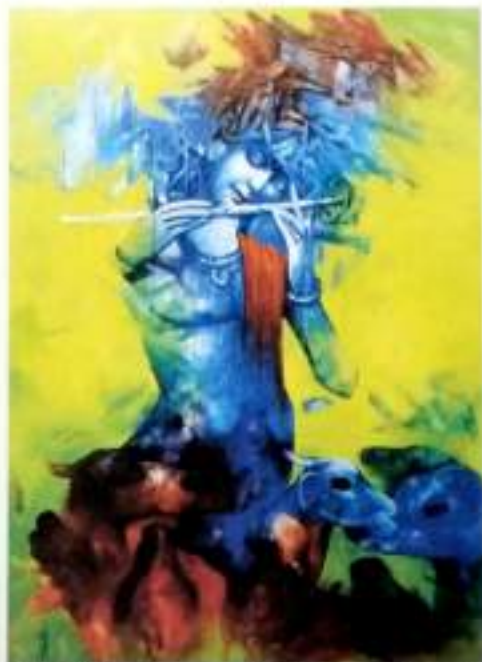
Krishna and cows 54" x 54" Mix media