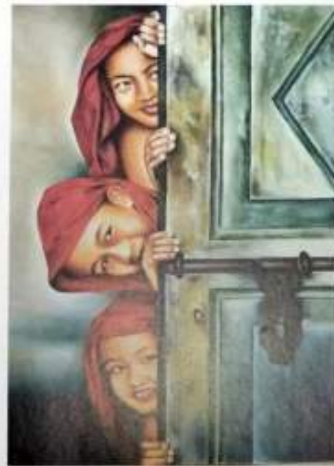
Innocence 30"x40" Oil colour