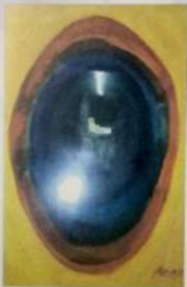
Meditation 18"x23" Water colour