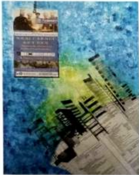
Idioms 20"x20" Mix media