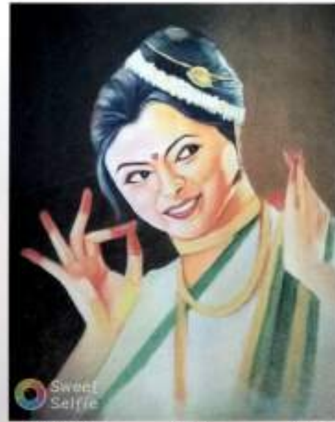
Dancing Potrait 40"x30" Acrylic