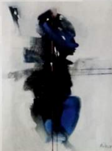
Untitled 30"x40" Acrylic