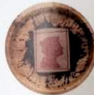
My own being 43.85 cm x 26.96 cm Intaglio on Ceramic